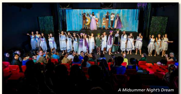
A Midsummer Night's Dream