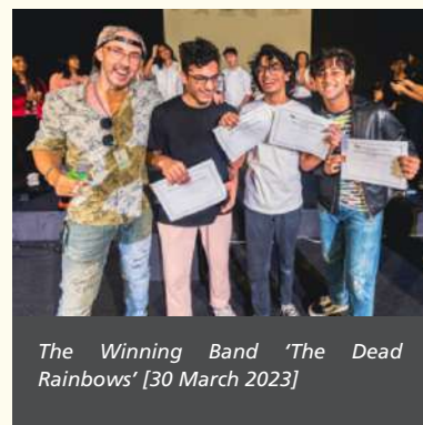
The Winning Band 'The Dead Rainbows' [30 March 2023]