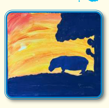
(The K2 Team)

In the polar region, the children read the story 'Rainbow Bear'. As a class, the children collaborated to make their own polar bear. They used a sponge to paint the background in rainbow colours, and then created the texture for the polar bear's fur by collaging with cotton wool, crepe paper, felt, and pompoms.