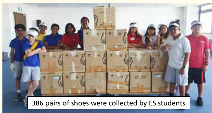
386 pairs of shoes were collected by ES students.