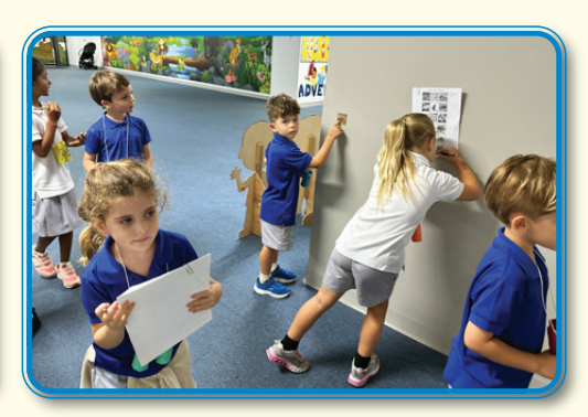
The K2 children have been thoroughly enjoying many fun and engaging activities in the unit "Animal Rescuers".