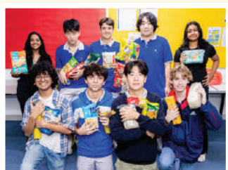
Food from the Heart

The Academic Calendar for the 2025-2026 school year is now available on our website. Stay informed about key dates, holidays, and important events. Please visit https://www.ofs.edu.sg/calendar/ to view or download the calendar.