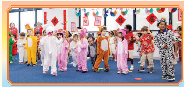
Chinese New Year